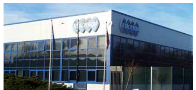
Fabricated sign trays