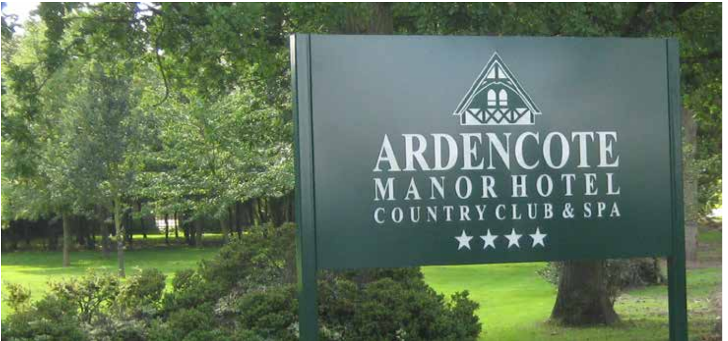
Post & Panel Sign