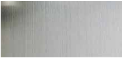
Satin Stainless Steel