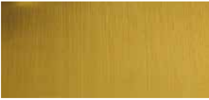
Satin Gold Titanium