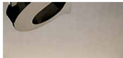
Polished Black Titanium