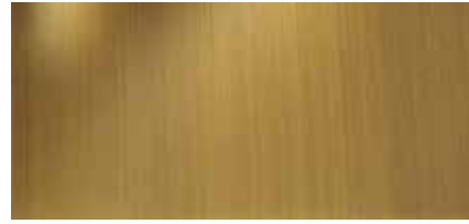
Light Oxidized Brass