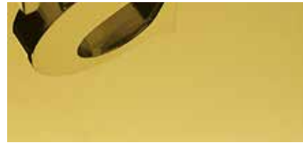
Polished Gold Titanium