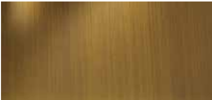
US10 B Oxidized Brass