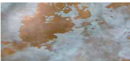
Patina Blue Copper