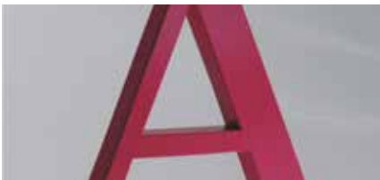
Painted Stainless Steel