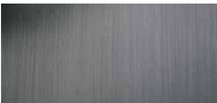
Satin Black Titanium