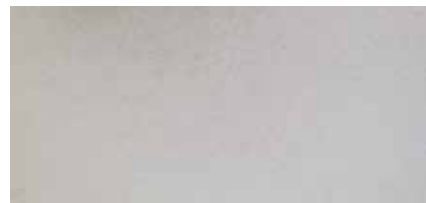
Bead Blasted Stainless Steel