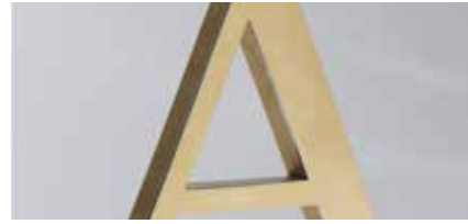
Titanium coated Stainless Steel (Shown in gold)