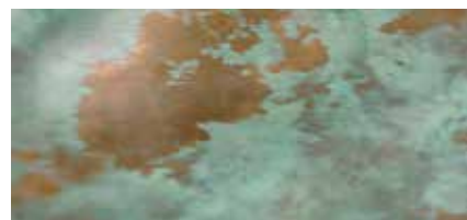
Verdigris Green Copper