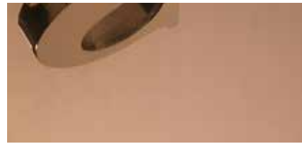
Light Polished Bronze Titanium