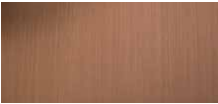
Light Satin Bronze Titanium