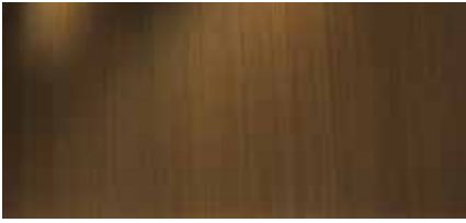
Dark Oxidized Brass